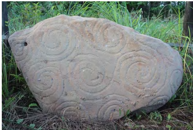
Figure 20. Batu Kalong Long Banga

In Long Banga, there is a carved stone with spiral designs, which the locals call Batu Kalong (Fig. 20). Mashman refers to this carved stone as “Batuh Narit Long Polong” (2018:118), and mentions its association with the Ngurek. In the Ngurek language, batu kalong basically means ‘decorated stone’ (see Jalong 1989:160). The carved stone in Long Banga measured about 1.6 m in length, 0.2 m in width and 0.86 m in height. It is interesting to note that at the border with Indonesian Kalimantan, there is another carved stone called Batu Kalong, which has also been attributed to the Ngurek (Sellato 2016).