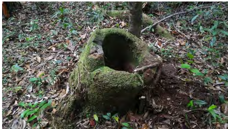
Figure 11. Stone urn at Lekad Kelesan.

This stone jar site is located on the Lekad Kelesan hill, about 900 metres above sea level. It was reached via a two and a half hours' walk from the Penan village of Long Beruang. To the east of Lekad Kelesan is the site of Long Jilen (see below). Approaching the top of Lekad Kelesan, several Penan hunters' camps were observed. During my visit to the site, I was told by my Penan informants that there were supposed to be two stone jars at Lekad Kelesan, but only one was found. This stone jar was undecorated, and it stood slightly slanted about 0.62 m above the ground surface, with a diameter of about 0.5 m, and rim thickness of about 7-8 cm (Fig. 11). The other stone jar, which we were not able to locate, was said to have fallen and was 'white' in colour. This I believe referred to the original grey colour of the sandstone material, as opposed to the usual 'green' colour of moss-covered stone jars found in the jungle environment. Compared to the other stone jar sites that I recorded in the Punang Kelapang area, the Lekad Kelesan site was the only one that was located on a hilltop, and not on a river bank.