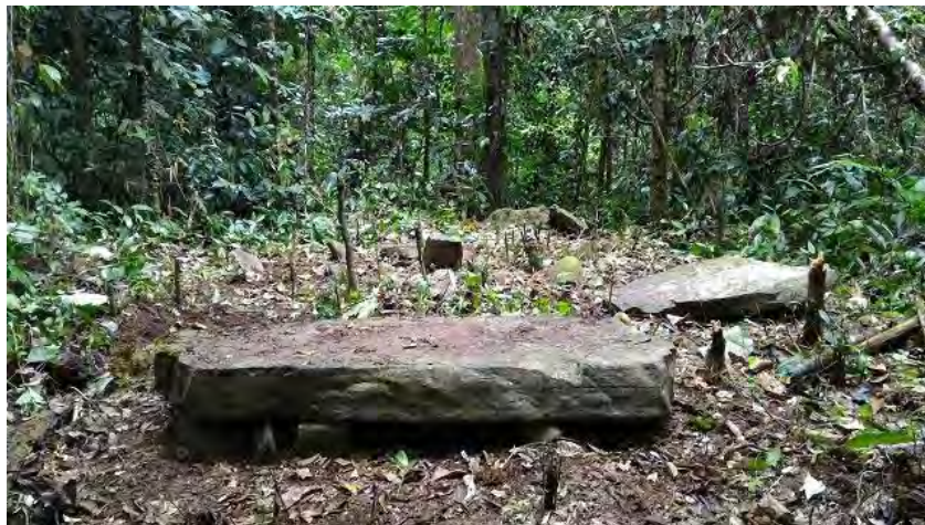
Figure 4. Dolmens at Long Belibat.

Menatoh Long Belibat is located on a promontory near the confluence ( long ) of the Belibat and Peluan rivers. Initially, dolmens were first seen in an area roughly six by ten square metres (Fig. 4). Here, two dolmens were discovered to be intact, one had partially collapsed, while seven others had collapsed. All of these dolmens were found placed between 0.5 m and 1 m apart from each other. The two intact dolmens vary in size. The bigger of the two measured approximately 2.05 m in length, 1.05 m in width and 0.33 m in height. The smaller dolmen, on the other hand, was about 0.95 m in length, 0.95 m in width and 0.36 m in height. Further clearing of the surrounding area revealed previously hidden or buried dolmens, all of which have collapsed. All in all, at least twenty-four dolmens were visible, with no regularity observed in their orientations. It is assumed that more dolmens are to be discovered if the whole area were to be cleared. In terms of area size and number of dolmens, Menatoh Long Belibat appeared to be a relatively large burial ground in the past.