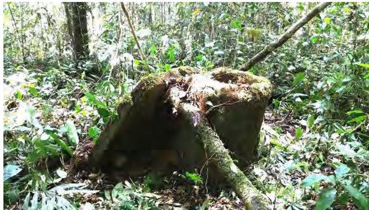
Figure 14. Stone jar with slab cover at Long Sebua'.

The Long Sebua' site is located on the right bank of the Sebua' River, near the confluence of the Sebua' and the Bale rivers. At the Long Sebua' site, at least nine stone jars were found, two of them still reasonably intact. The larger of the two measured about 0.97 m in height and 0.7 m in diameter, with a rim thickness of about 9 cm (Fig. 14). A large stone slab jar cover measuring 1.53 m in length, 1.1 m in width, and 0.12 m in thickness was found leaning on the large stone urn. The other smaller stone jar, on the other hand, measured approximately 0.95 m in height and 0.44 m in diameter, with thickness of around 6 cm. Closer examination revealed the presence of grooves on the rim of this stone jar, which may have functioned to stop the slab cover from slipping off the top of the stone jar.