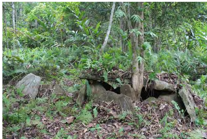
Figure 7. A dolmen at Binatau Long Pulong.

Binatau Long Pulong is located on the Pulong River, about 45-minutes' walk from the village of Long Banga, near an area presently farmed by members of the Kenyah Leppo' Ke community. The site consists of at least 16 dolmens, most of which have collapsed, either partially or entirely. The dolmens appeared to be of various sizes. The biggest dolmen discovered on a small hill on the left (following river flow) bank of the Pulong River is approximately 3 m in length, 1.8 m in width and 1 m in height (Fig. 7).