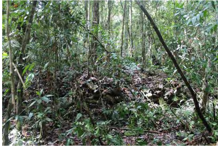
Figure 18. Perupun Long Senibong.