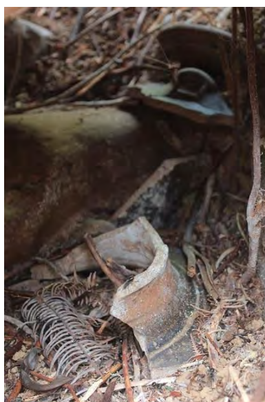
Figure 10. Stoneware jar fragments found inside the dolmen at Long Sena.

Inside the dolmen, three stoneware jar fragments were visible, all of which could have belonged to a single vessel (Fig. 10). No bone remains or other artefacts, which could have been the contents of the stoneware jar, were observed. It was also unclear whether the jar fragments were contemporaneous with the dolmen, or a later deposit.