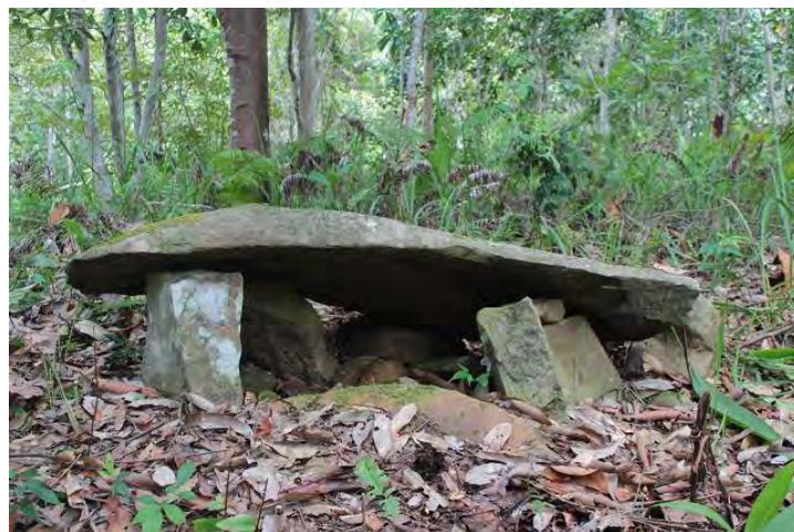
Figure 8. Another (smaller) dolmen at Binatau Long Pulong.

A smaller intact dolmen found on the right bank of the Pulong River measured approximately 1.75 m in length, 0.75 m in width and 0.5 m in height (Fig. 8). According to Kenyah Leppo' Ke informants, the Long Pulong dolmens are believed to have been constructed by the Ngurek. I was also informed that the site was visited and cleared by a group of Ngurek from Long Semiyang in 1995 (Charles Gau, personal communication, January 20, 2017).