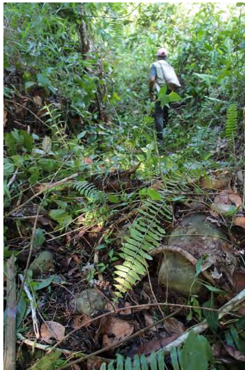
Figure 17. Part of Perupun Lio Ayu, near the Kelabit village of Long Peluan.

Perupun Lio Ayu, or “Perupun Oloh Lio’ Ayu” in Mashman (2018:118), is a stone mound site located on the right bank of the Bale River, a short walk’s away from the village of Long Peluan (Fig. 17). The stone mound was estimated to be about 20-30 m in diameter and about 2-3 m in height. Surrounding Perupun Lio Ayu were farmland and wet rice fields. The stones used for building the mound were probably sourced from the nearby Bale River. Perupun Lio Ayu is another megalithic site associated with the Ngurek. According to Mashman (2018:116), Lio Ayu means ‘island of the enemies’ in the Ngurek language, and that “it recalls the time of warfare and alliances with the Ngurek.”