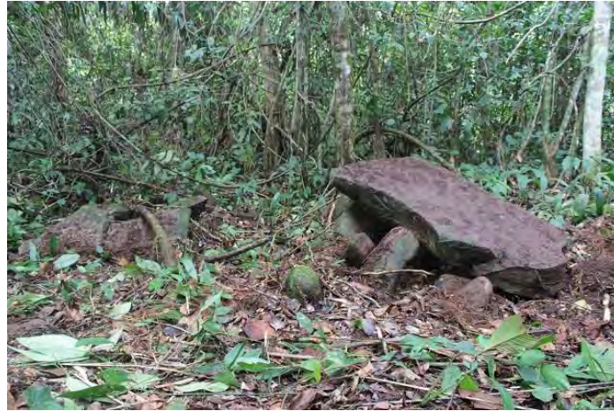
Figure 5. Two dolmens at Menatoh Tang Lapao.