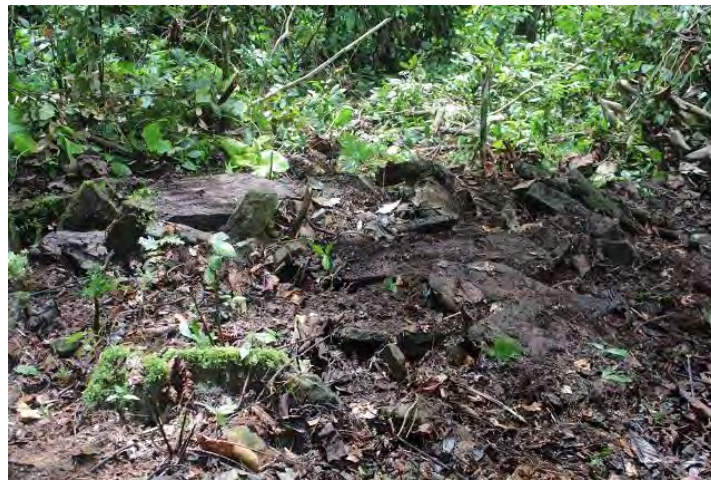
Figure 6. The damaged site of Menatoh Long Belilin.

The site of Menatoh Long Belilin is located near the confluence of the Belilin and the Baram (Kelapang) rivers. According to Mashman (2018:119), “this is close to Long Moyo, the site where the Kelabit and the Ngurek settled.” The Long Belilin site was damaged by logging activities in the 1990s (Fig. 6). Therefore, it was difficult to estimate the number of dolmens that used to be present in the area. Logging activities have since ceased. Nowadays, the surrounding area is frequented by hunters, as evidenced by the presence of a hunter’s camp near the site. According to my informant, the camp is used by Penan hunters from the village of Ba’ Lai.