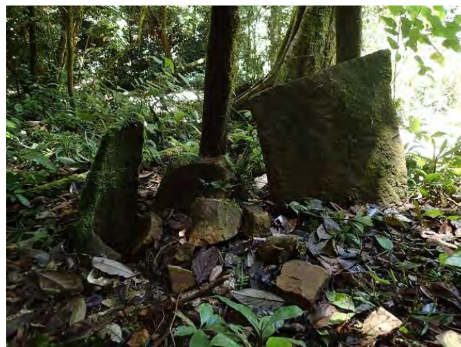
Figure 13. Fragmented stone jar with slab cover at Long Jilen.

The site of Long Jilen is located on left bank of the Beruang River, near its confluence with the Jilen River. It is situated about two-hours' walk from the Penan village of Long Beruang on an old jungle trail heading northwards to Bario. A total of three stone jars were observed; all of them fragmented, which made estimation of their dimensions difficult. Nevertheless, their maximum diameters were approximately 0.5 m. A single stone slab, which may have been a jar cover, was found next to one of the broken jars (Fig. 13). A few metres southwest of the stone jars, two small upright stones (rising no more than 0.7 m above ground) were observed. Near the upright stones, there were two partially buried stone slabs. It is possible that the upright stones and stone slabs were fragments of former stone jar burials.