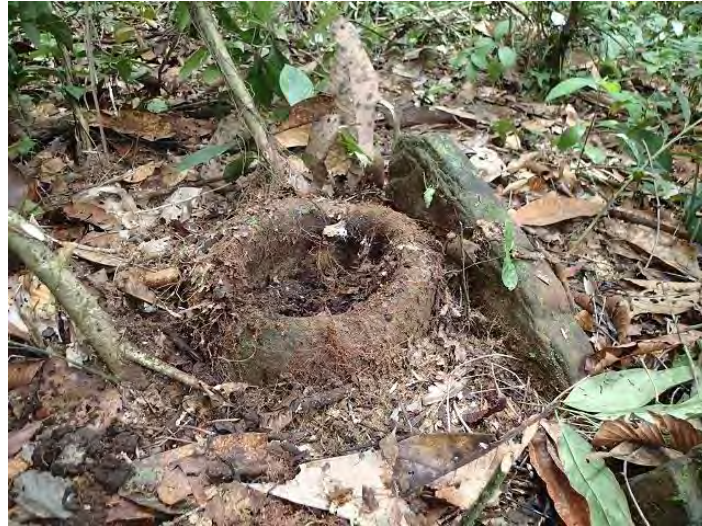
Figure 12. Partially buried stone jar with slab cover at Long Punyao.

Two of the stone jars observed at Long Punyao were reasonably intact to be measured. One stood 0.13 m above the ground surface, with a maximum diameter of 0.4 m, and rim thickness of about 5 cm (Fig. 12). A stone slab, which could have been the cover of the stone, was found next to it, partially buried. The exposed part of the stone slab measured 0.6 m in length and 0.25 m in width, with a thickness of about 7 cm. Another stone jar in the vicinity was found fragmented towards the top, with a maximum height of 0.27 m, maximum diameter of 0.54 m, and rim thickness of 6 cm.