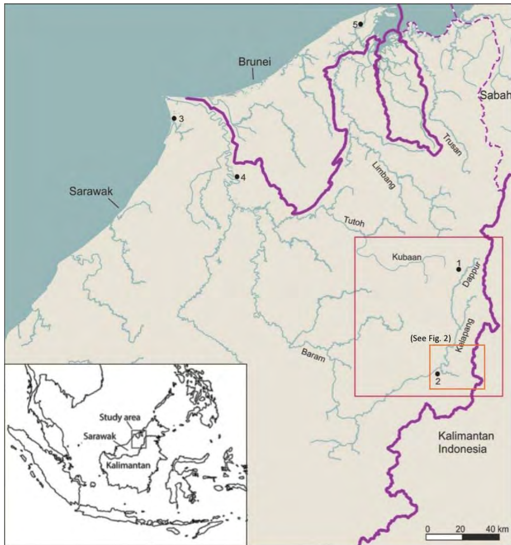
Figure 1. Map showing the location of Punang Kelapang, within the Upper Baram region in Sarawak, Malaysian Borneo, with major towns indicated: 1) Bario; 2) Long Banga; 3) Miri; 4) Marudi; and 5) Bandar Seri Begawan (Map data ©OpenStreetMap contributors. Inset map from Nyiri [2016])

neighbours who are all agriculturalists, the Penan were traditionally nomadic hunter-gatherers (Needham 1972), who became settled beginning in the 1950s. It should also be mentioned that in the late 18 th century and early 19 th century, the area was inhabited by a group of people called the Ngurek (Jalong 1989, Sellato 1995). As will be apparent further below, some of the megalithic monuments in Punang Kelapang have been attributed to the activities of the Ngurek (see also Mashman 2017). At present, the Ngurek can be found living in Long Semiyang, Long Banyok and Long Ikang, further downriver on the Baram.