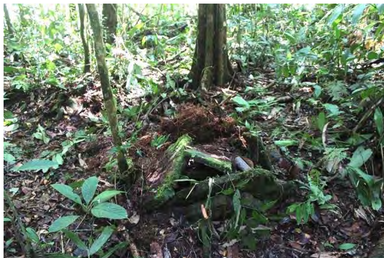
Figure 15. Slab-built cist grave at Long Sebua'.

Prior to visiting the Long Sebua' site, I was informed that it was a stone jar site. However, besides stone jars, there were also three slab-built cist graves, similar in appearance and form to others found in the Kelapang River area, for example, at Pa Di't and Arur Tara (Lindsay Lloyd-Smith, personal communication, October 18, 2016) (Fig. 15). Two of these cist-graves at Long Sebua' were reasonably intact to be measured. They measured 1.2 m by 0.8 m by 0.2 m, and 1 m by 0.65 m by 0.3 m, respectively.