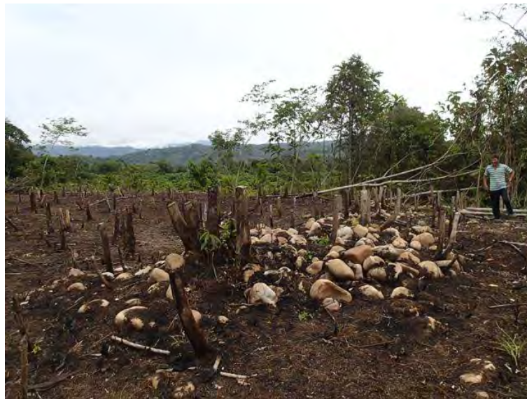
Figure 19. Pelpuun Arool Batang.

Pelpuun Arool Batang is located on what is currently farmland, just south of the airstrip in Long Banga. When visited in 2015, the site was cleared for the planting of paddy, which exposed the stones to view (Fig. 19). There were at least seven or eight concentrations or piles of stones of various sizes. Local Sa'ban believe that stone mounds or pelpuun are burial places of people and property in the past.