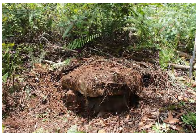
Figure 9. A partially exposed dolmen at Binatau Long Sena.

A single dolmen was observed at Binatau Long Sena and it was located on a farmland, high on the left bank of the Puak River, not far from the confluence of the Sena and the Puak (Fig. 9). The dolmen was found entirely covered by vegetation and a fallen tree trunk. Clearing of the surrounding had to be done in order to take measurements and photographs of the dolmen. At a certain point, however, clearing had to be stopped due to the discovery of a big ant's nest on top of the dolmen. Thus, the dolmen was not entirely exposed, which resulted in incomplete measurement of its dimensions. While measurement of its length was unobtainable, its width and height were approximately 1.1 m and 0.5 m, respectively. The dolmen was oriented east-west lengthwise, roughly parallel to the Puak River.