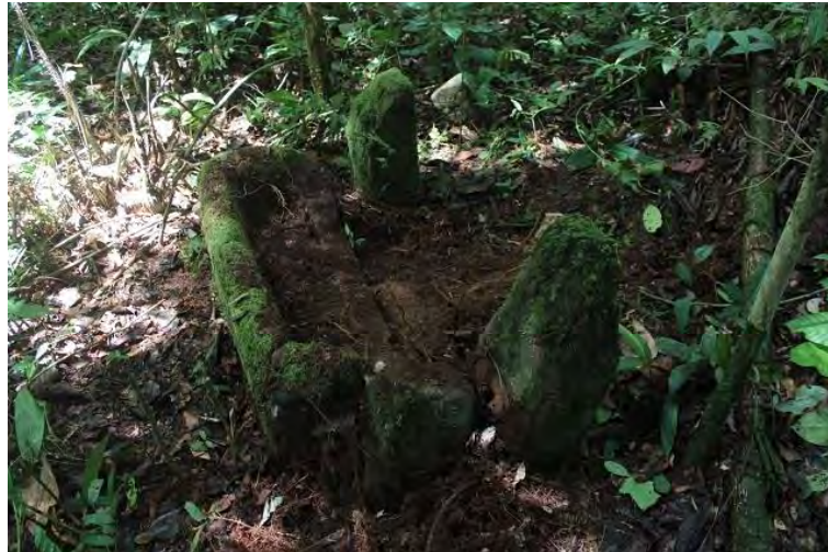
Figure 16. Stone trough at Long Sebua’.

Another interesting find was a stone trough, measuring about 1.07 m in length, 0.3 m in width, with a maximum thickness of around 0.12 m. Near the stone trough were five stones, which could have functioned as stands (Fig. 16). In terms of form, the stone trough is similar to the “rectangular with rounded base” type (Sellato 2016:123), found in the Bahau region in Indonesian Kalimantan, which have been attributed to the Ngurek.