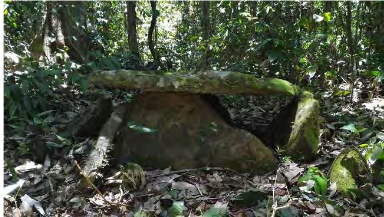
Figure 3. A dolmen at Menatoh Buduk Dusur.